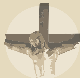
Crucifix about 1410-1415