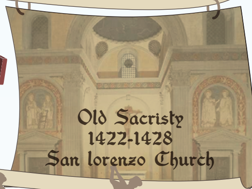
Old Sacristy 1422-1428 San Lorenzo Church